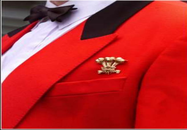
The famous Red Jacket of the London Welsh Male Voice Choir

Information sheet & Newsletter #1 September 2010